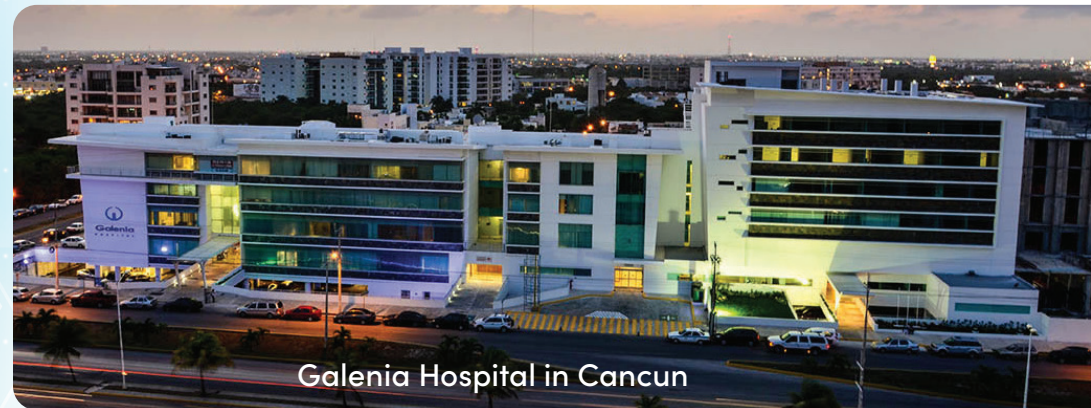
Galenia Hospital in Cancun

Our partnership with NASH means ZERO costs to you for orthopedic surgery and high-cost specialty prescription medications.